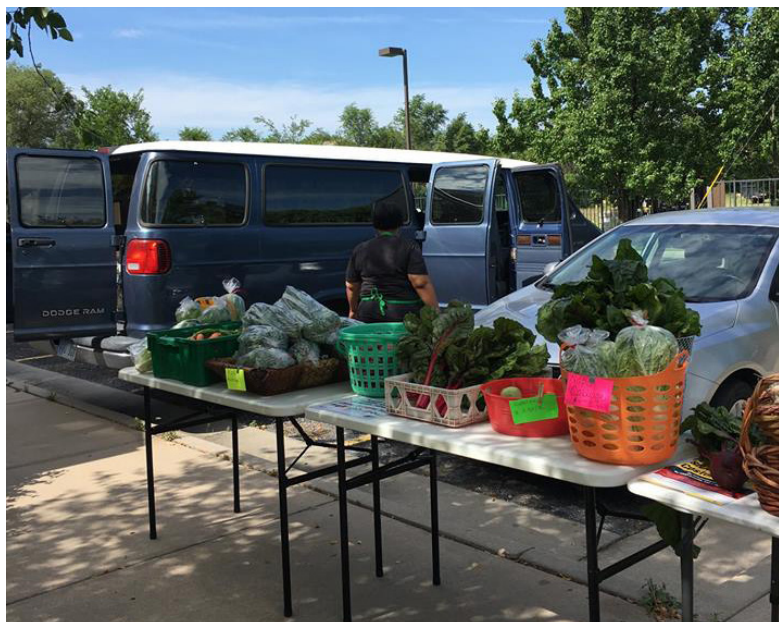
Common Ground setting up a delivery of fresh local produce.