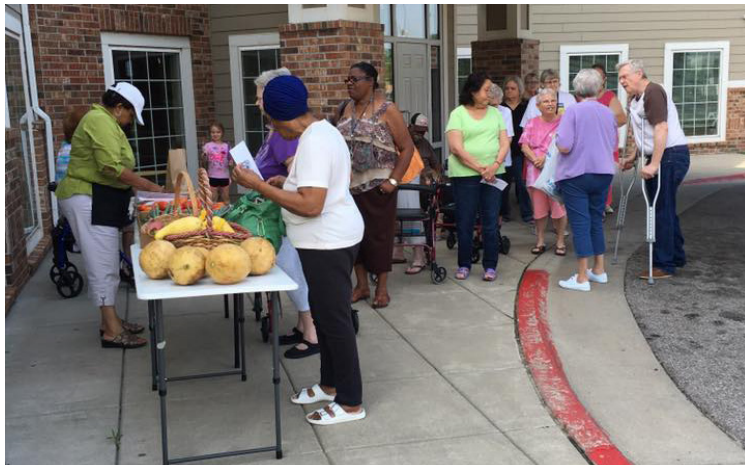
Customers in line for Common Ground delivery.

Common Ground Producers and Growers has filled a critical need in the Wichita community and beyond by bringing healthy, local food to underserved areas. By building deep relationships with community members, local producers, and partners, they have also identified and addressed other needs beyond food. Using KHFI funding to support their network of local producers, Common Ground is building the urban agriculture movement and creating sustainability in the mobile market.