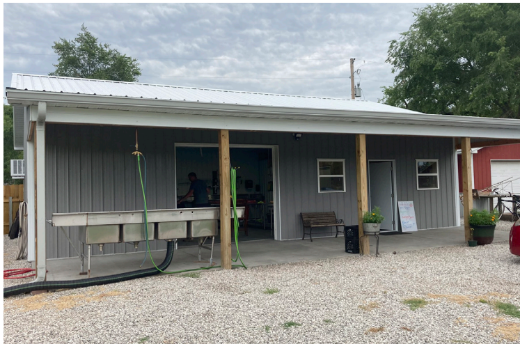
Post-harvest facility constructed with KHFI funding.

The Tecklenburgs have been able to make their dream a reality through dedication, patience, and community relationships. Their new post-harvest handling facility allows produce grown at Teck Farms to stay fresh longer, opening up new potential markets where the Tecklenburgs can supply high-quality, nutritious food.