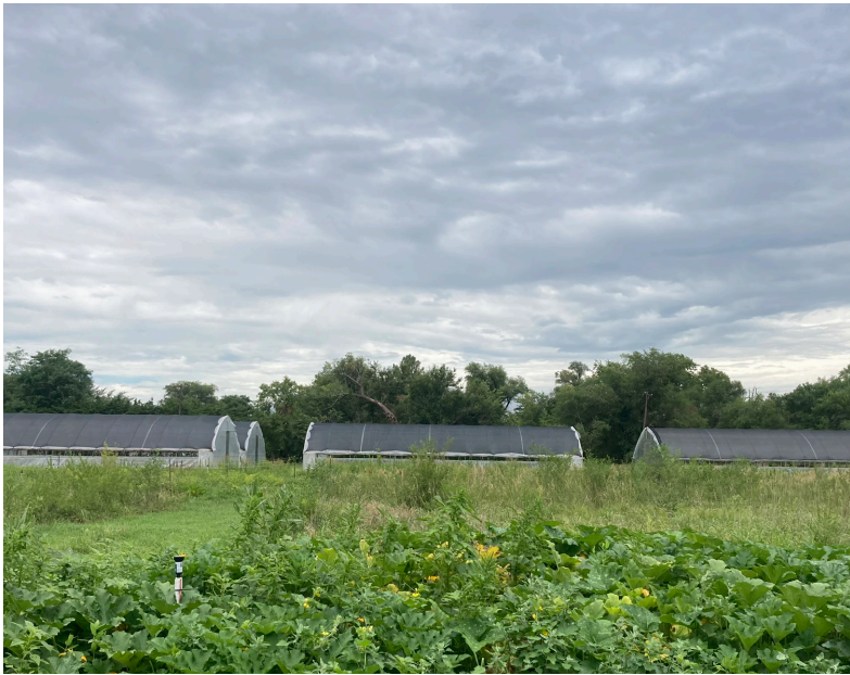
High tunnels at Teck Farms.