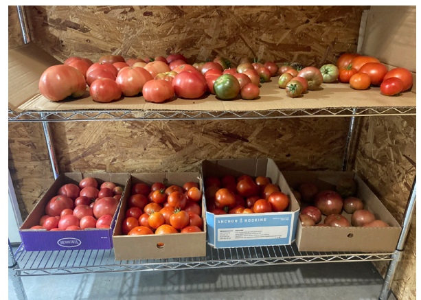
Teck Farms tomatoes to be sold at Smith's Market.

Chris and Shawna are learning as they go and making big plans for the future. They received cost share for three additional high tunnels and were approved for a grant from KHFI to build a permanent produce stand. They are now researching the possibility of a mobile market to reach other parts of town and are ambitiously waiting for the opportunity to hire more employees, accept SNAP, and build an educational facility. The Tecklenburgs consider their farm to be a model for strengthening local food systems, and eventually, they want to help establish urban farms in other cities.